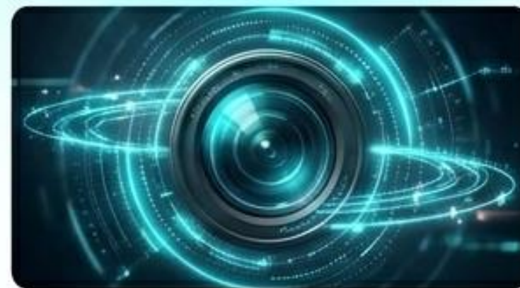
Camsense AI Lens (Proactive)

State: Reactive (after-the-fact investigation).