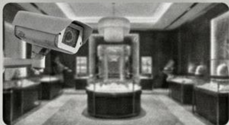
Traditional CCTV (Passive)